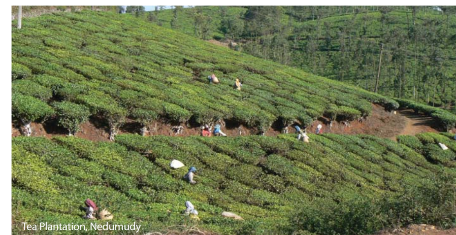
Tea Plantation, Nedumudy

MAKE THE MOST OF YOUR HOLIDAY Singapore Hotels and Touring (see page 49)