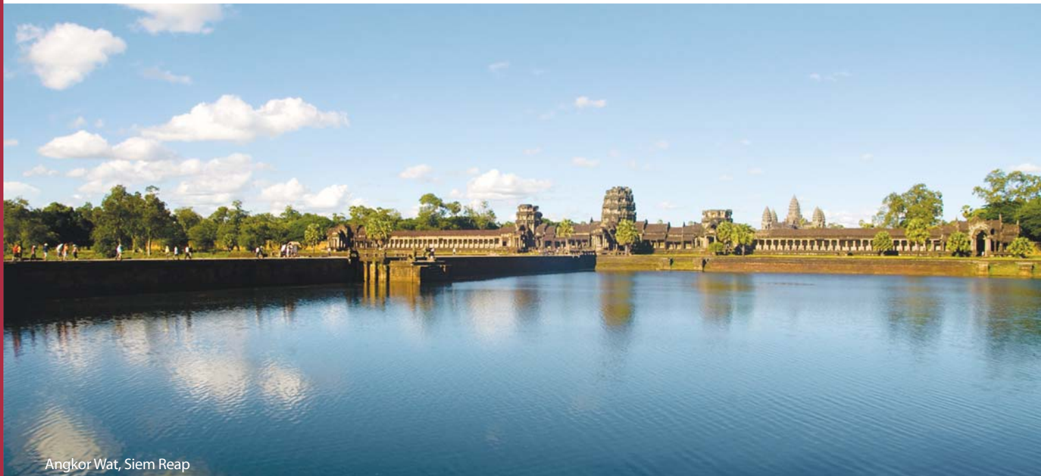
Angkor Wat, Siem Reap